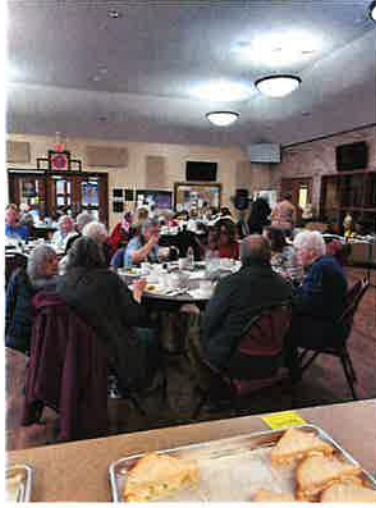
2025 Lenten Lunches