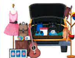
Trunk/ Vendor Sales