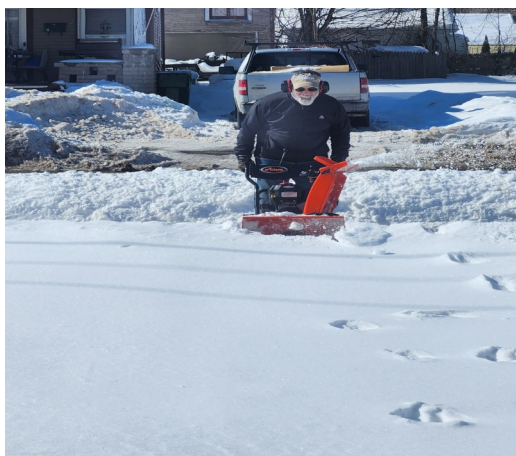
Thanks to one of our behind the scenes angels. So grateful for his dedication.