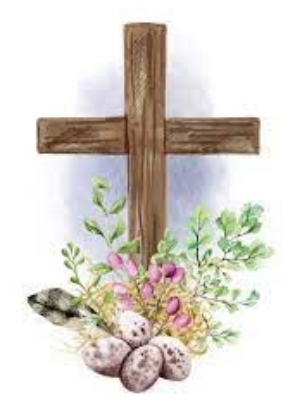
HE IS RISEN!

Women's Saturday Bible Study 2nd & 4th Saturday at 9:30 AM Clothes Closet Open April 19 from 9:00-11:00 AM